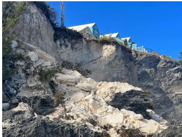
Bermudiana Beach Hotel after Ernesto.

Ernesto's visit was a reminder that even 'just' a Cat 1 hurricane is a force to be reckoned with. Fortunately, the impact on BNT's historic buildings and nature reserves was relatively minor. However, with forecasters predicting up to 10 more named storms in the Atlantic this season, it seems we are now living with the predicted effects of climate change.