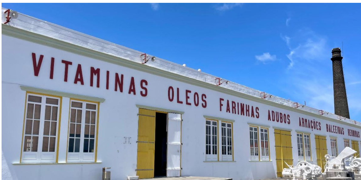
Whaling Industry Museum located in the original whale oil, flour and vitamins factory on Pico.